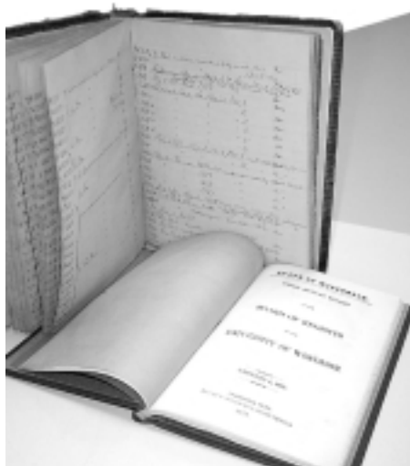
A library ledger and an 1851 annual report.

"With Discriminating Knowledge" continues through March 2004.