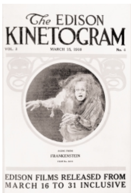
The Edison Kinetogram , Vol. 2, No. 4. (1910). London: Edison Films.

publication, and the contrasts between science as conducted in the novel and as pursued in the twenty-first century.