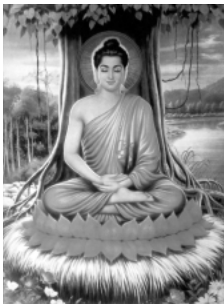
Thích Trí Tịnh. Kinh Đại bảo tích . TP. Hồ Chí Minh: Thánh hội Phật giáo TP. Hồ Chí Minh, 1994.